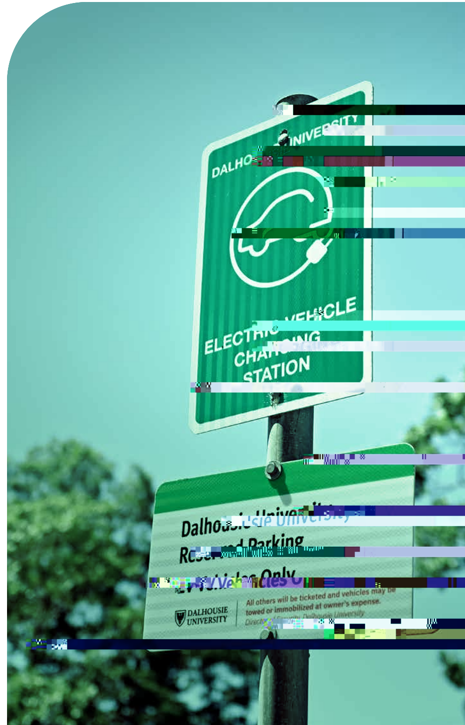
Electric vehicle charging station