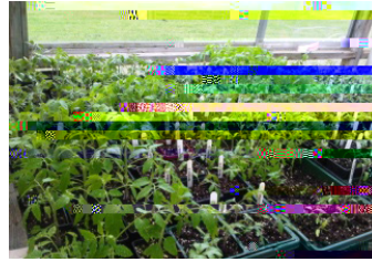
A small, low-cost greenhouse can provide transplants for many gardens.

A small, low-cost greenhouse can provide transplants for many gardens.